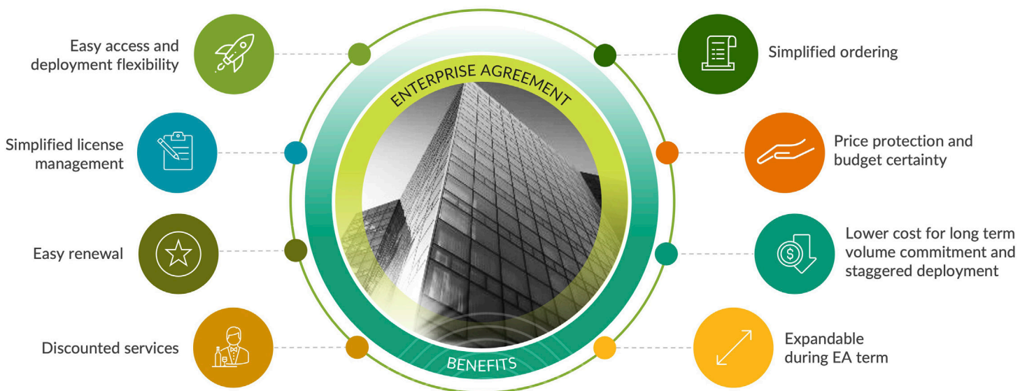
Figure 1: Juniper Enterprise Agreement Benefits

The Juniper Packaged Enterprise Agreement includes many benefits that are not included in standard purchase agreements (Figure 1), which we've mapped to key outcomes (Table 1).