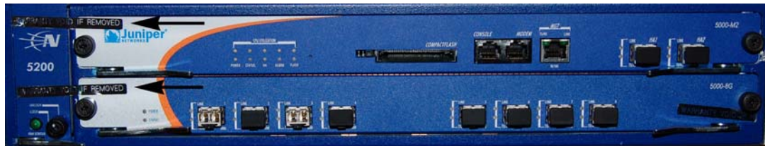
Fig. 2: Tamper Evident Mechanisms, Front of NetScreen-5200