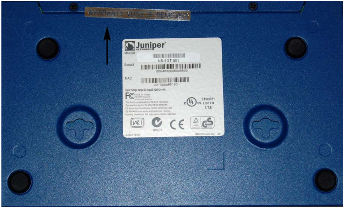
Figure 2: Underside of the NS-5GT, with location of tamper evident seal