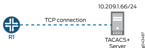
Figure 1: Topology

This example configures R1 with three customized login classes: Class1, Class2, and Class3. Each class defines access privileges for the user by configuring the permissions statement and by defining extended regular expressions using the allow-commands and deny-commands statements.